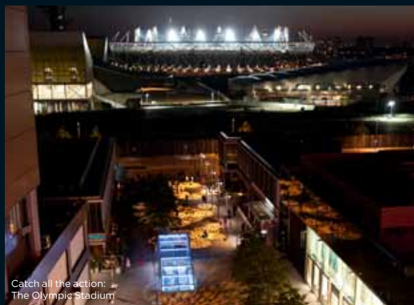
Catch all the action: The Olympic Stadium