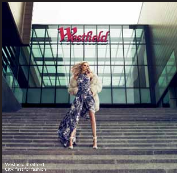
Westfield Stratford City: first for fashion