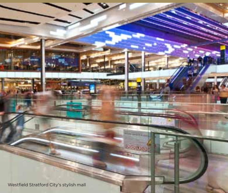
Westfield Stratford City's stylish mall

5 THE ROYAL DOCKS – The Royal Docks is home to a vast expanse of water, fringed with striking landmarks – relics of its industrial heritage as well as iconic new developments. The Thames Flood Barrier, ExCeL London and, opening in 2012, the Siemens Crystal sustainability centre and the Emirates Air Line cable car are but a few attractions. You can also take part in sailing and other water-based sports. Visit visitroyaldocks.com