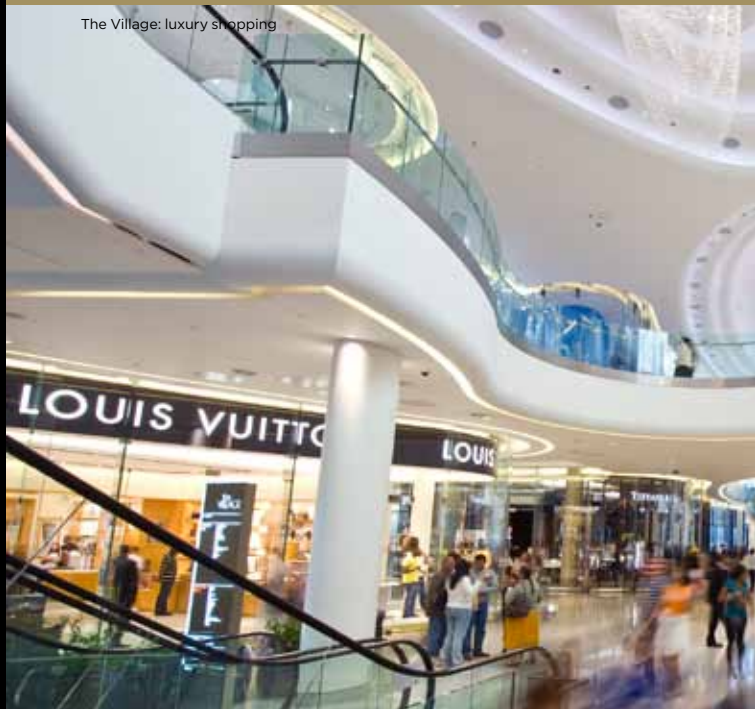
The Village: luxury shopping

The Village is an ever-evolving space that cleverly combines shopping with culture. Events, exhibitions and fashion installations are hosted regularly in The Village to create an inspirational and culturally stimulating destination.