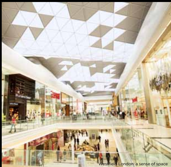
Westfield London: a sense of space