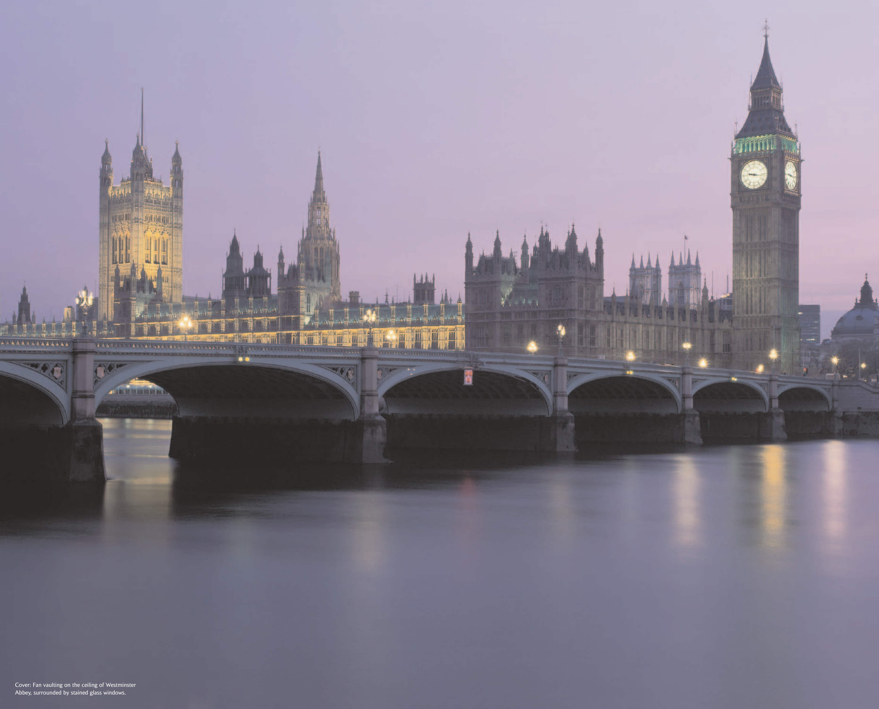
Cover: Fan vaulting on the ceiling of Westminster Abbey, surrounded by stained glass windows.